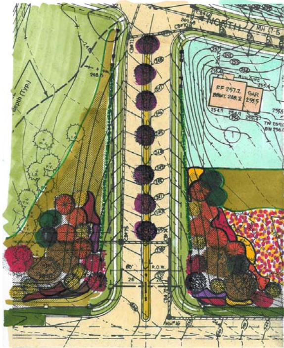
Concept Centerville Rd. Entrance

In 2003, Firm Principal, Carl Kelemen was asked to create a comprehensive landscape and open space Master Plan and develop a Trail System plan for this 130-acre site of over 135 single-family homes. After many meetings with the Landscape Committee, the master plan concept was presented to the full Homeowner's Association in an open member's meeting which resulted in the Association voting to assign a special levy of $800 per year over a 5-year period. The assessment was dedicated to improvements in lighting, decorative entrances, and other details that will result in increased property values.