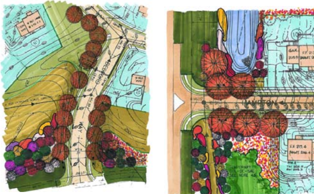
Other Entrance Concept Sketches